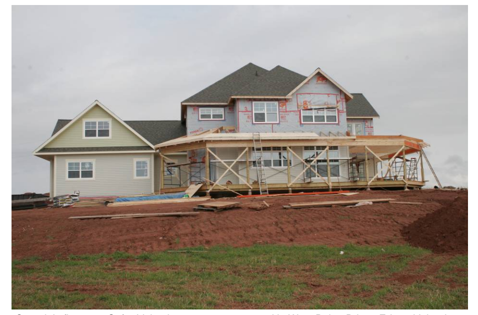
Canada's first-ever Safer Living home was constructed in West Point, Prince Edward Island. The house, a partnership between ICLR and The Co-operators, was built after the family's original homestead was destroyed by fire in April 2005.