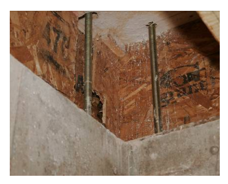
The frame of the home is bolted to the foundation.

In the months and years to come, additional safer living homes will be built in various regions of Canada. The homes will be designed to be resilient to the weather perils in that area, which may include earthquakes. prairie wildfire, tornadoes and hail storms. 🗶