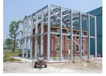
Figure 1: Full-scale house test specimen inside galvanized steel reaction frame.

The structural steel reaction frame was delivered and erected, as an in-kind donation from the Ontario Region of the Canadian Institute for Steel Construction, in late June 2006. Figure 1 shows the full-scale house test specimen inside the nearly complete reaction frame