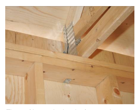
The roof is attached to the frame using special clips.