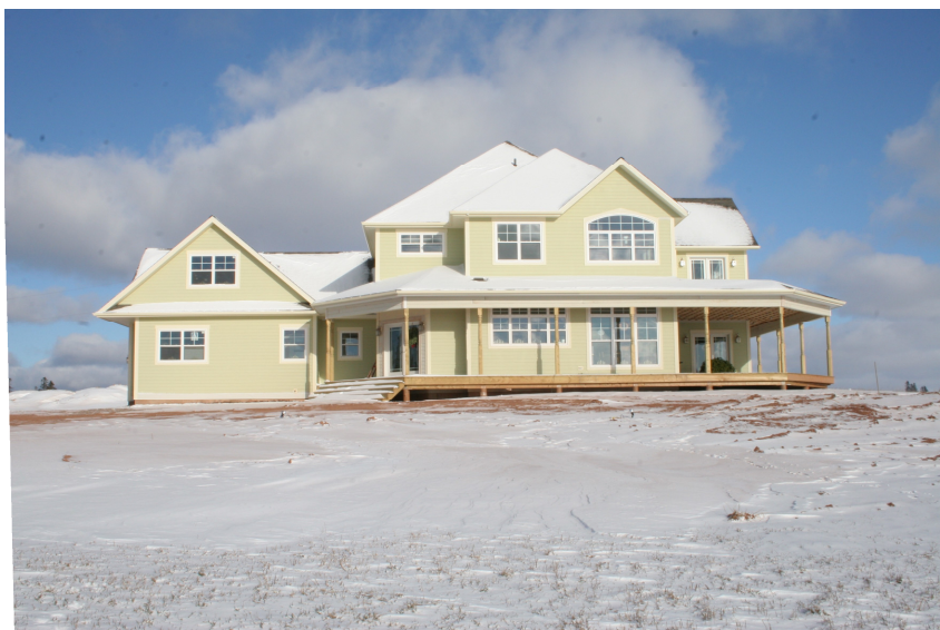
ICLR's first Designed...for Safer Living Home located in West Point on the western shore of Prince Edward Island

Canada's insurers are looking to work with builders to promote the design and construction of disaster resilient homes. This loss prevention strategy is essential to confront the alarming international trend of rising disaster damage. To learn more about our program please visit our website at iclr.org or contact Grant Kelly at gkelly@iclr.org or 416-364-8677 🐾