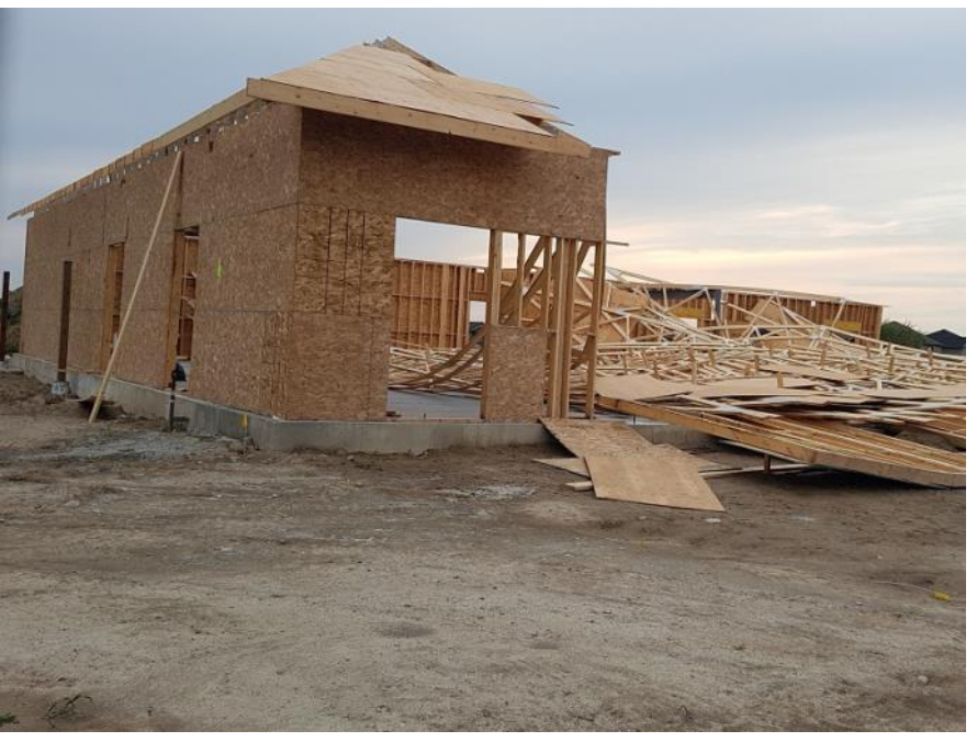
Failure of partially constructed wood-framed office in Ilderton, Ontario October 7, 2017

Researchers from Western London, in the community of Ilderton "which was hit by high straight line winds on Saturday, October 7," ICLR reported. ►