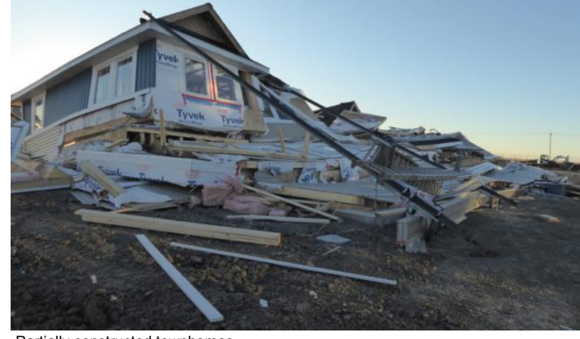
Partially constructed townhomes collapsed in Regina, Saskatchewan October 18, 2017

This article first appeared in Canadian Underwriter Online, October 16, 2017