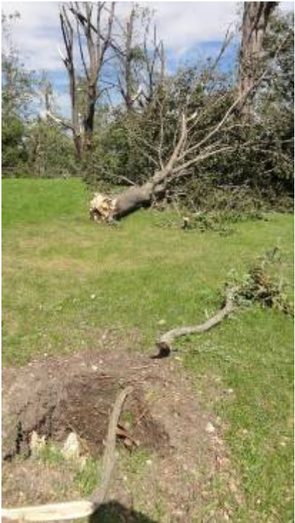
Figure 6: Root break tree failure.

The state of emergency that was declared by the city of Goderich remained in effect for at least three weeks post storm to assist with the recovery efforts. A number of agencies and organizations assisted with the emergency response and recovery efforts. While overall the response was successful, these events reinforce the need for efficient communication and planning. Practice events which include all the stake holders would go a long ways to improving both response time and overall effectiveness. Homeowners are also reminded to do their part by having an emergency plan and by having