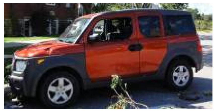
Figure 3: Brick protruding from windshield.

provisions to last a minimum of 72 hours in the event of a natural disaster.