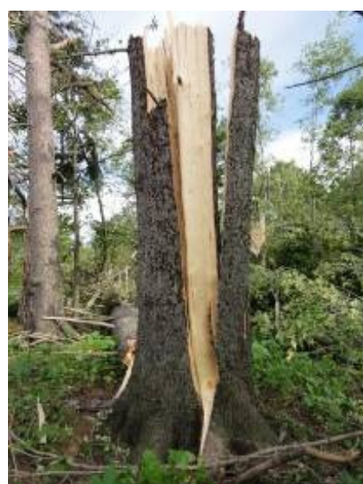
Figure 4: Stem break tree failure.

damage path also sustained significant damage and were found to typically fail by three methods; stem break - where the trunk of the tree is snapped a few metres above the ground (Figure 4), wind throw – where the tree is pushed over at the base and the root ball is unearthed (Figure 5), and root break - where the trunk snaps off at the ground (Figure 6). The majority of the trees were found to be mature and well rooted, although some were observed to be weakened by rot. The majority of the trees located in the central square were either