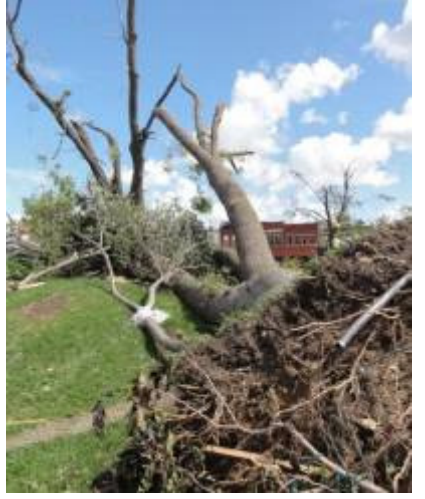
Figure 5: Wind thrown tree failure.

damage path also sustained significant damage and were found to typically fail by three methods; stem break - where the trunk of the tree is snapped a few metres above the ground (Figure 4), wind throw – where the tree is pushed over at the base and the root ball is unearthed (Figure 5), and root break - where the trunk snaps off at the ground (Figure 6). The majority of the trees were found to be mature and well rooted, although some were observed to be weakened by rot. The majority of the trees located in the central square were either