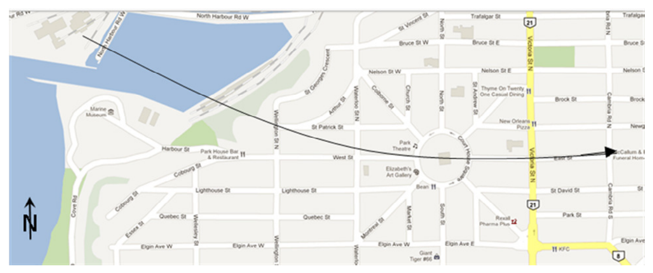
Figure 1(a): Tornado path through downtown square.

side perimeters of the damage path. When compared to other