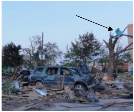
Figure 2: Damage to vehicles, debris field and displaced chair.

side perimeters of the damage path. When compared to other