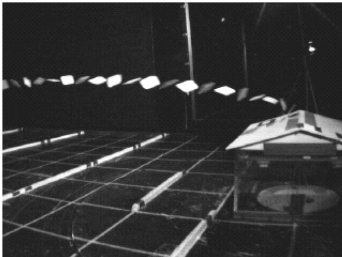
(Left) Flight of a roof sheathing panel from a gable roof in a wind tunnel study simulating Hurricane Andrew conditions. Wind is from right to left, with the (Right) distribution of failure wind speeds as measured over many repeated tests.

knowledge we have about these severe winds. To aid our understanding, wide ranging wind damage research is being conducted at the University of Western Ontario (under the sponsorship of ICLR and NSERC, in partnership with Environment Canada) to develop greater numbers of damage indicators - based on scientific testing - to obtain more realistic wind speed estimates for severe windstorms. We are focussing on two aspects which have not been previously utilized, namely wind throw of trees and flight of wind-borne debris. In this brief note, we focus only on the latter. ►