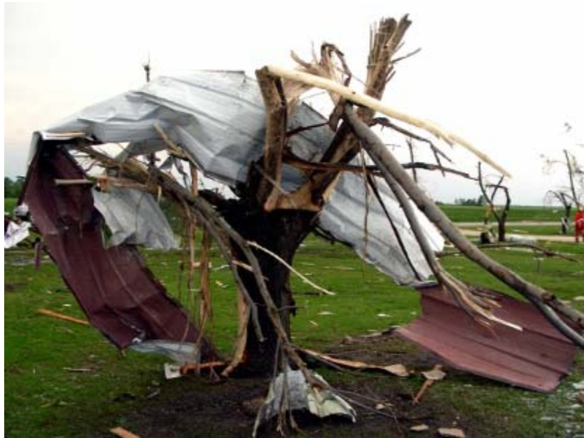
Wind-borne roofing material "caught" by a tree in Elie, MB.

In the United States, the Fujita Scale was recently revised with what is now called the Enhanced Fujita Scale, which includes a wider range of structural damage indicators which include a new range of (reduced) wind speeds at the higher end of the scale. It is important to realize that all of the information we use regarding tornado wind speeds comes from damage surveys and the