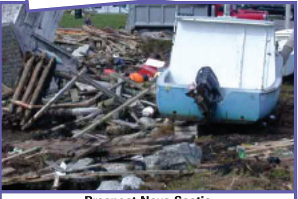
Prospect Nova Scotia